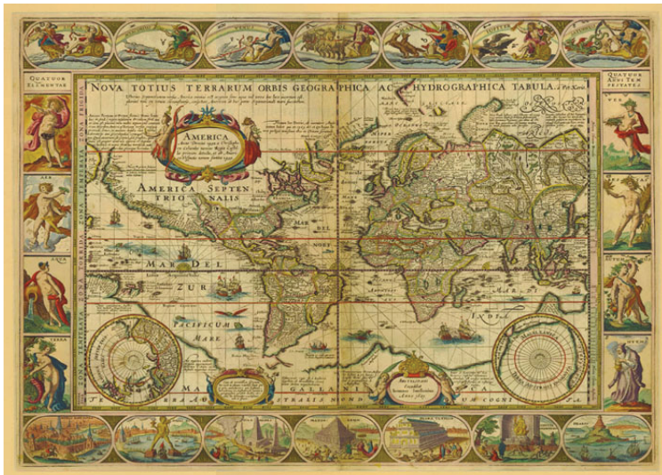
Fig. 2. Map of Nova Totius Terrarum 1608 AD