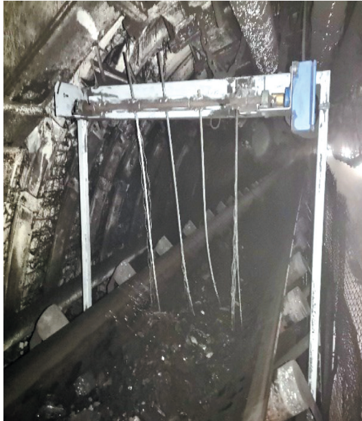
Fig. 3. Excavated material presence sensor

This sensor allows you to mechanically determine the presence or absence of mined material in key places along the haulage route and transmit this information to the local controller. Additionally, in local controllers, in order to distinguish the innovative operating mode from the others, it was called the “intelligent” mode.