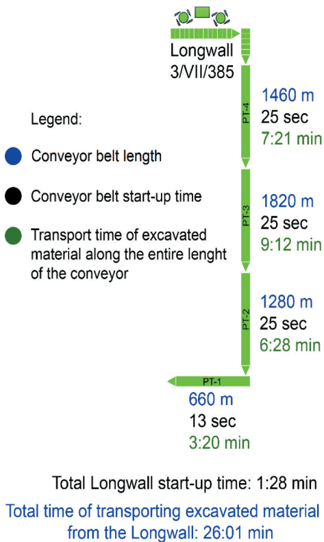
Fig. 1. Analysis of key times in the excavated material haulage system

belt conveyors and the cumulative transport times of mined material from the wall to the retention points, during which the stopping of any element of the haulage chain means a break in the entire mining process. The discussed study also included a technical proposal to improve the process of transporting excavated material, which was later implemented for general use in the coal mining process at the LW “Bogdanka” mine. The analysis of factors affecting the continuity of the work of the haulage of excavated material consisted of writing down all the processes which occurred during the operation of individual belt conveyors during their normal operation and interpreting these processes as a function of time.